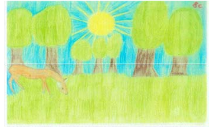
Vision of a bridge to the economic system of the nature. Is this a market?

A second part, Disparities and interactions between nature's and human systems, refers to the leading aims and indicators of the System of National Account (SNA) of the United Nations and of